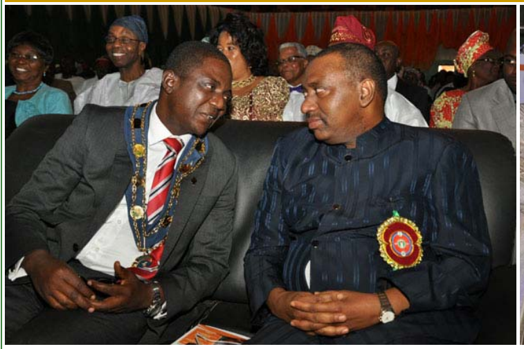
NSE President Engr. Ademola I. Olorunfemi, FNSE, chatting with Minister of State Works