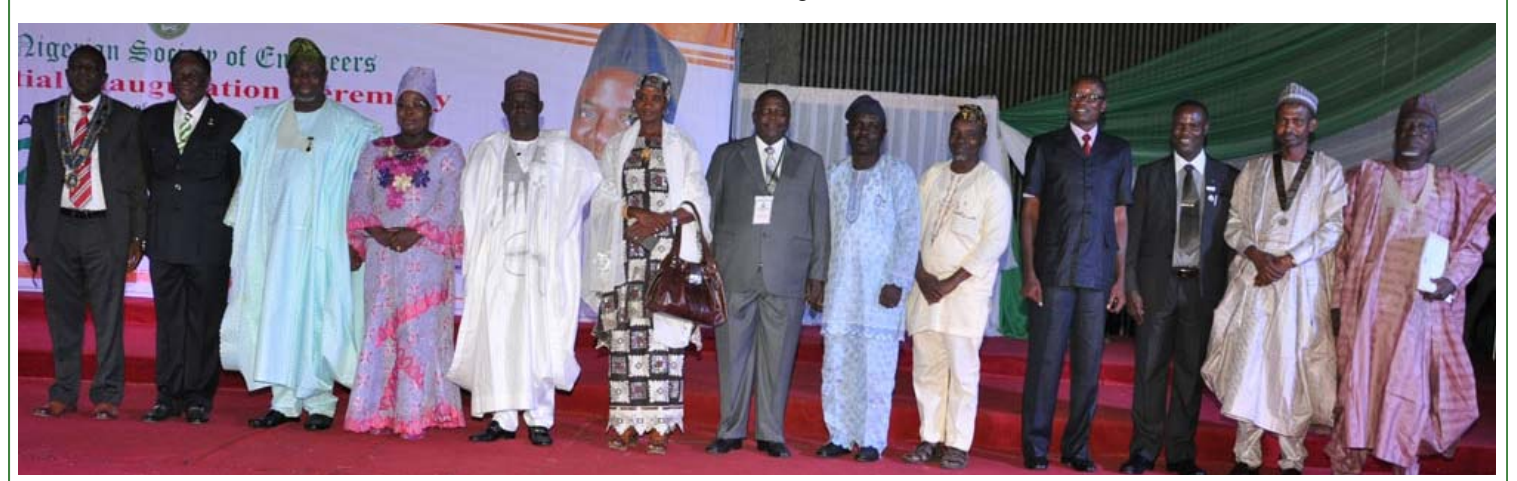
The Nigerian Society of Engineers 2014 Executive Committee members shortly after they were sworn in.